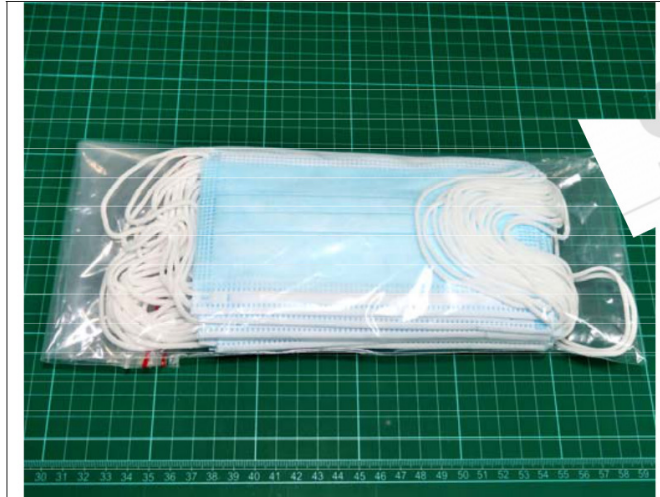
Photo A: Appearance of the sample - T-1090929-02